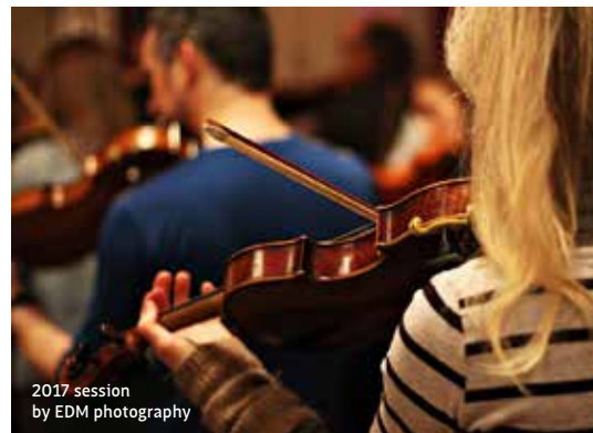
2017 session

Looking for something a bit faster? This one's for you!